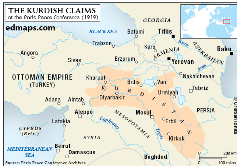
Figure 1: First Map of Kurdistan

Given that the Kurdish Nation has never been a defined state, establishing borders was an issue for the nation throughout its history. The first officially proposed map of Kurdistan came after the collapse of the Ottoman Empire post World War I, during the 1919 Paris Peace Conference. Kurdish delegates proposed the first map of Kurdistan, which is only a bit smaller than the greater Kurdistan region proposed by today's Kurdish nationalists.