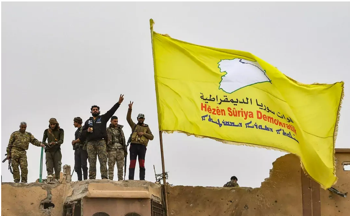
Fighters from the Syrian Democratic Forces (SDF) fly a flag in Baghouz, Syria.

northern Syria that had been previously held by YPG forces. According to the United Nations, tens of thousands of residents were forced to leave their homes. A year-long battle followed and the Syrian Kurds announced victory over the Islamic State. The SDF (Syrian Democratic Forces) took control of areas around the Syrian town of Baghouz, near the Iraq-Syria border, the last populated area held by the Islamic State.