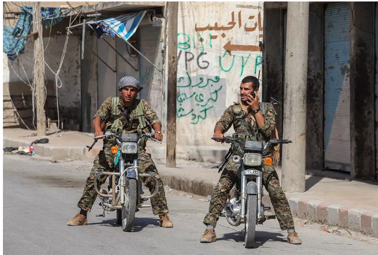
YPG fighters take control of Tal Abyad, dealing a blow to the Islamic State.

As part of the fight against the Islamic State, Turkey joined in and started to bombard the group's positions in Syria. At the same time, Turkey attacked PKK targets in Iraqi Kurdistan, putting a stop to the two-year battle. Two years later, the U.S intervened by providing arsenal aid for Syrian Kurds. As the US-led coalition against the Islamic State got ready to take Raqqa, President Donald Trump of the United States accepted a plan to arm the Syrian Democratic Forces (SDF), a militia dominated by the YPG, directly through the Defence Department.