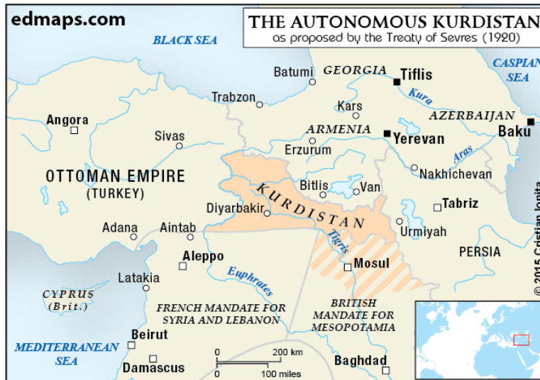
Figure 2: Second Map of The Autonomous Kurdistan

In January 1946, Rizgari Kurd, an Iraqi Kurdish predecessor of the Kurdistan Democratic Party, made an unsuccessful formal appeal to the United Nations for Kurdish self-determination and sovereignty. Kurds created the Republic of Mahabad, a short-lived, self-governing state in the Kurdish lands of Iran that fell under Soviet authority during WWII. After the Soviets left in December 1946, Iran took back Mahabad. While in exile in the Republic of Mahabad, Mustafa Barzani, considered the founder of Kurdish nationalism, established the Kurdish Democratic Party of Iraq. It was the only Kurdish party in Iraq until the 1970s when it was renamed the Kurdistan Democratic Party (KDP), which remains to this day the dominant Kurdish party.