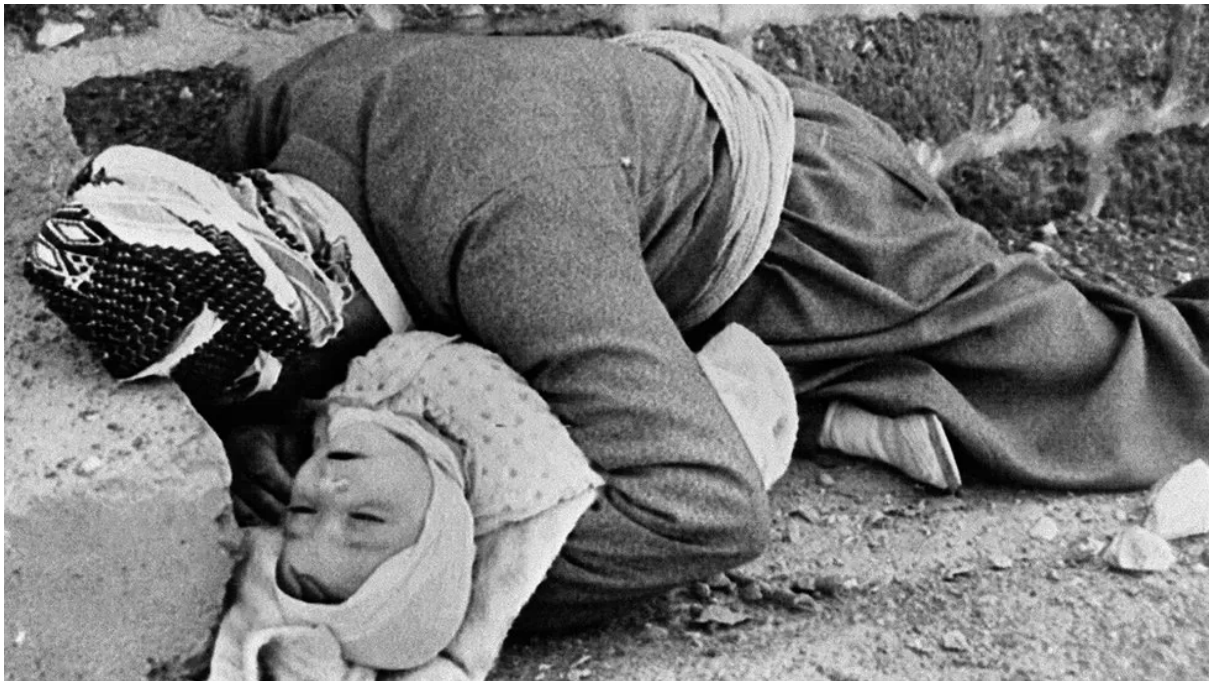
A Kurdish father and his babe in arms were among thousands of victims of a poison gas attack on Halabja https://www.bbc.com/news/world-middle-east-15467672

Continuing with Saddam Hussein's dictatorship, in 1988 the Kurdish genocide, also known as the Anfal Campaign, occurred. A deliberate and ruthless assault against the Kurdish population caused more than 100,000 deaths and was strongly condemned by the international community as a violation of human rights and acts of genocide.