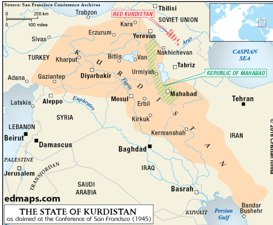
Figure 3: Third map of the State of Kurdistan.

In June 1961, Political leader General Mustafa Barzani called upon Iraq’s leader General Karim Kassem to release political prisoners and end the brutality made by the Iraqi government during the Kurdish rebellion. During the following years, there were temporary truces during the conflict, even though violence did not cease. Iraqi leaders made agreements and pledges of autonomy to the Kurdish population which they then reneged upon. Furthermore, in 1974, the Kurds rejected an autonomy plan and the armed conflict continued with fierce fighting from both sides.