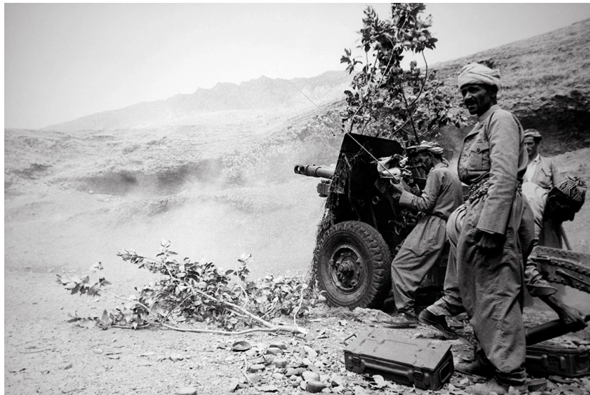
Kurdish fighters are seen in Rawanduz, Iraq, in September 1974.

Jalal Talabani and other Kurdish leaders established the Patriotic Union of Kurdistan (PUK) in 1975 in response to the events of Saddam Hussein's dictatorship. The PUK was a key player in the Kurdish resistance movement against Saddam Hussein's administration, working to advance the rights and interests of the Kurdish people.